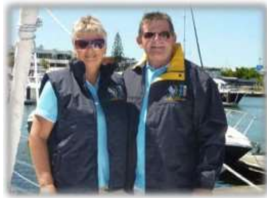
Vest $64 Delivered